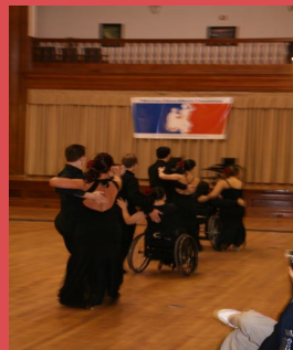
ADF Formation Team Performing at Walter Reed Army Medical Center