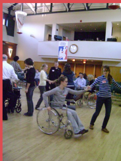
ADF Demonstration at Kutztown University