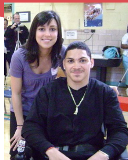
ADF Students at Widener Memorial School